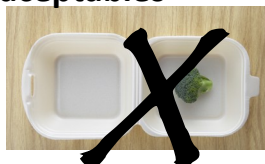
Foam (e.g. Styrofoam) Espuma de poliestireno