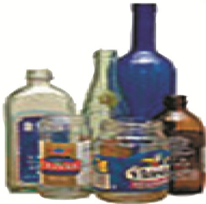
Glass Bottles & Jars Botellas de Vidrio