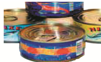
Steel Cans & Empty Aerosol Cans Latas de Fierro Y Latas Vacías de Aerosoles