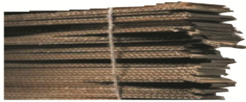
Flattened Cardboard 3'x3' Carton 3'x3'

No greasy pizza boxes/No cajas de pizza grasosa