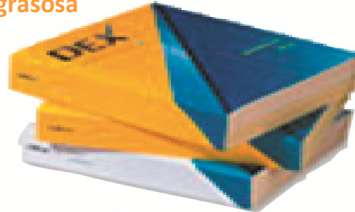
Phone Books Libros Telefonicos