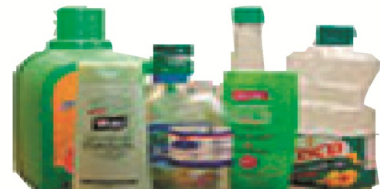
All plastic containers #1 & #2, Plastic bottles w/neck #3 - #7 Todo recipiente plástico, #1 y #2; Botellas plásticas con cuellos, #3 - #7