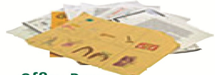
Office Paper Papel de Oficina