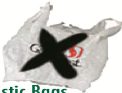
Plastic Bags Bolsas de Plastico