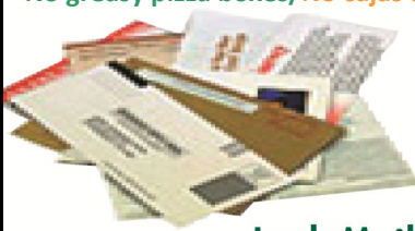
Junk Mail Desperdicio de Correo