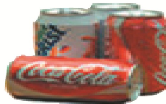
Aluminum Cans, Pie Tins